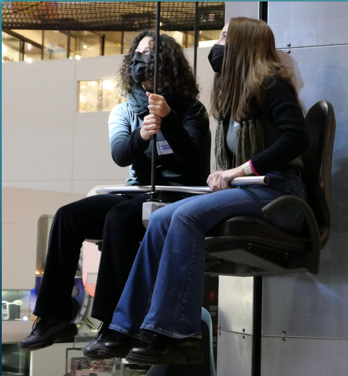
Visiting AHHA science center, Tartu, Estonia, March 2022