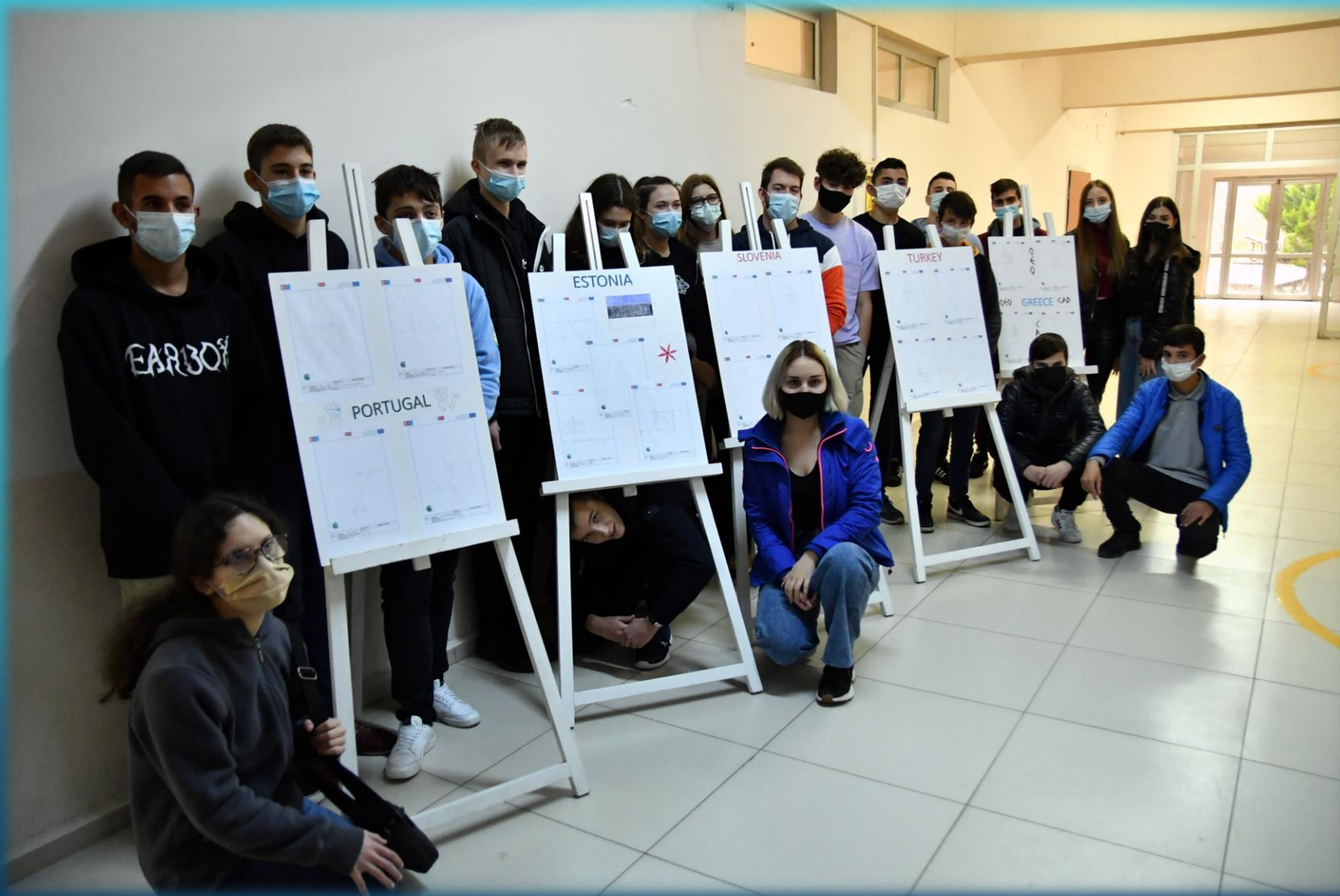
Exhibition of the Euclidian geometric drawings, produced during the meeting in Dereli, December 2021