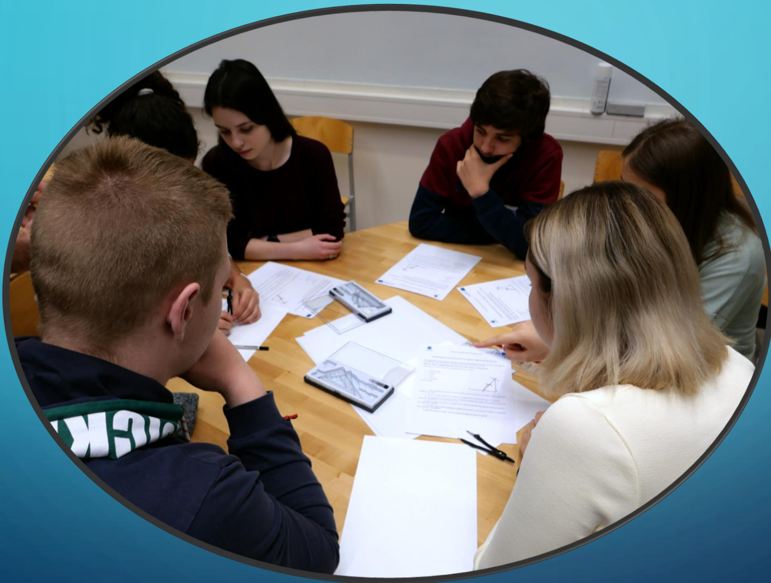
Workshop Technical drawing, Tallinn, March 2022