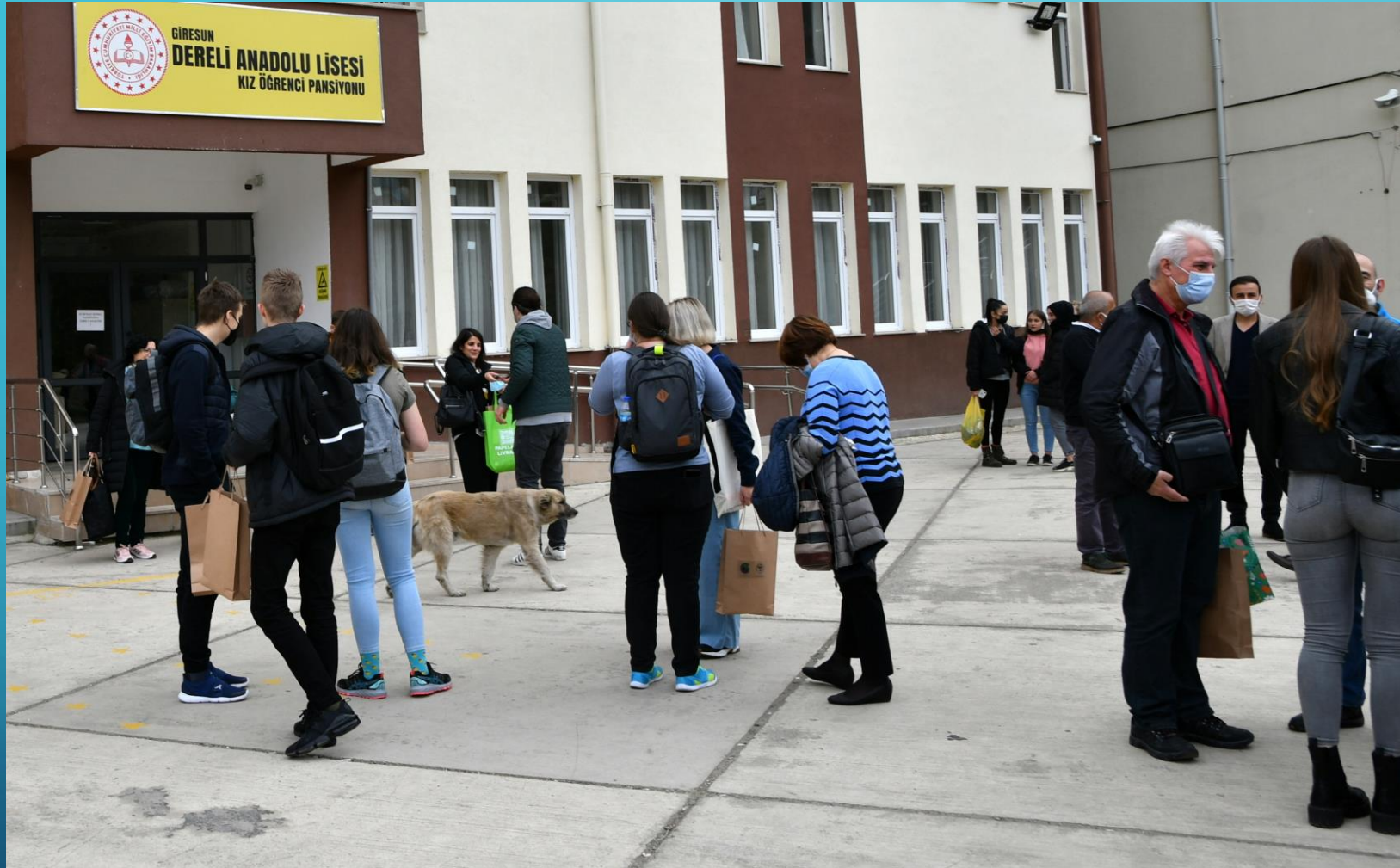
Students and teachers from all the participating countries in front of the school in Dereli, Türkiye, December 2021