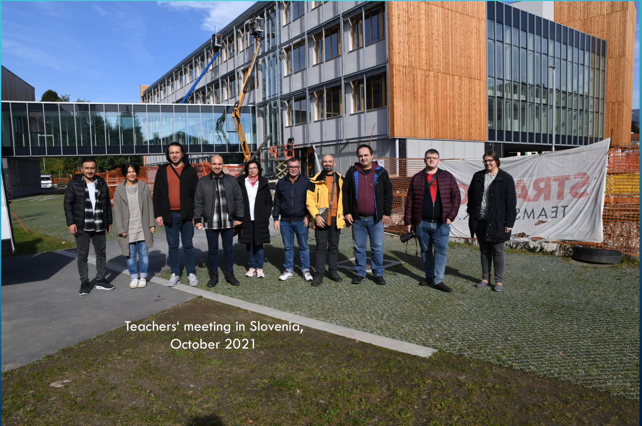
Teachers' meeting in Slovenia, October 2021