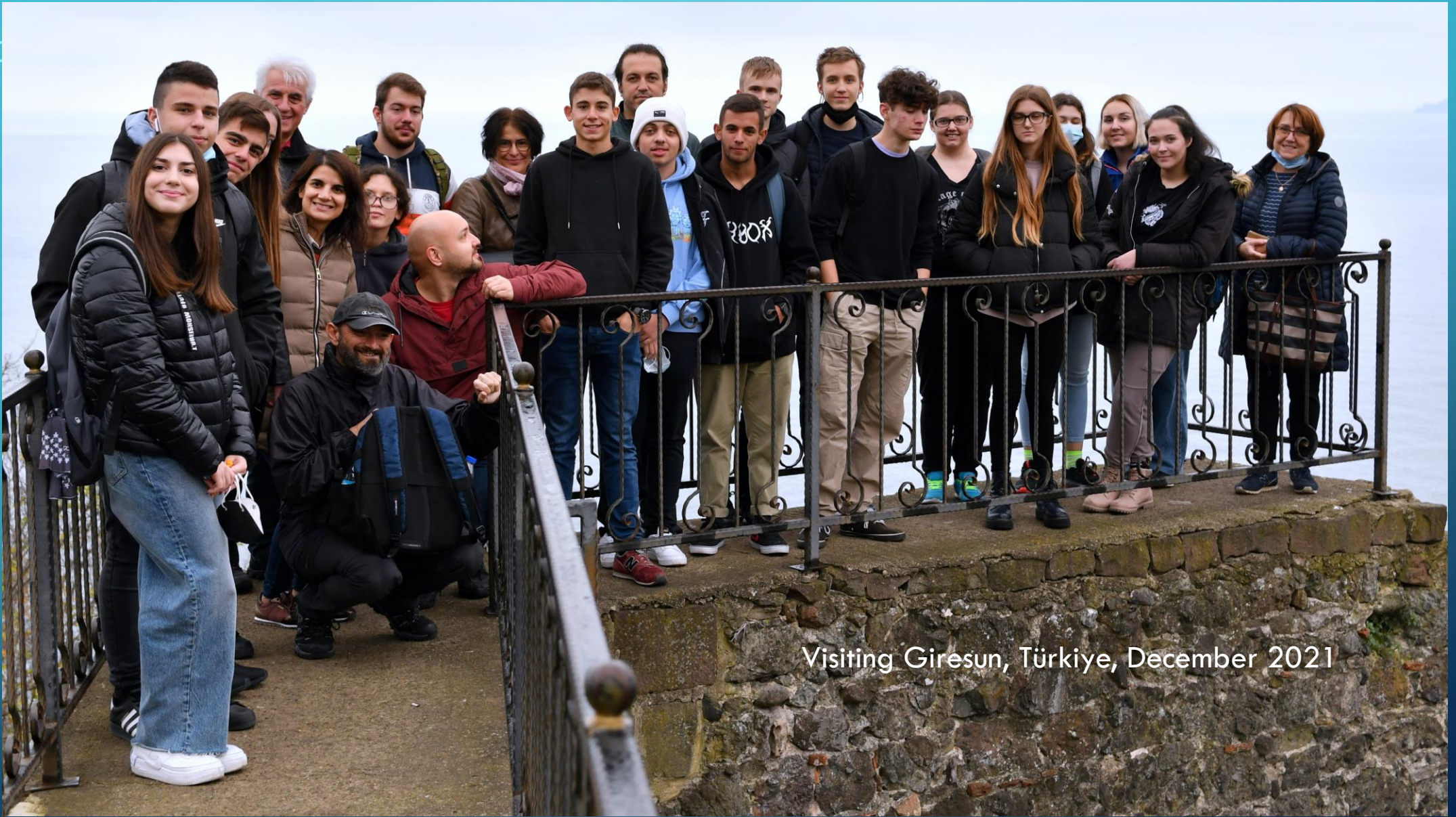
Visiting Giresun, Türkiye, December 2021