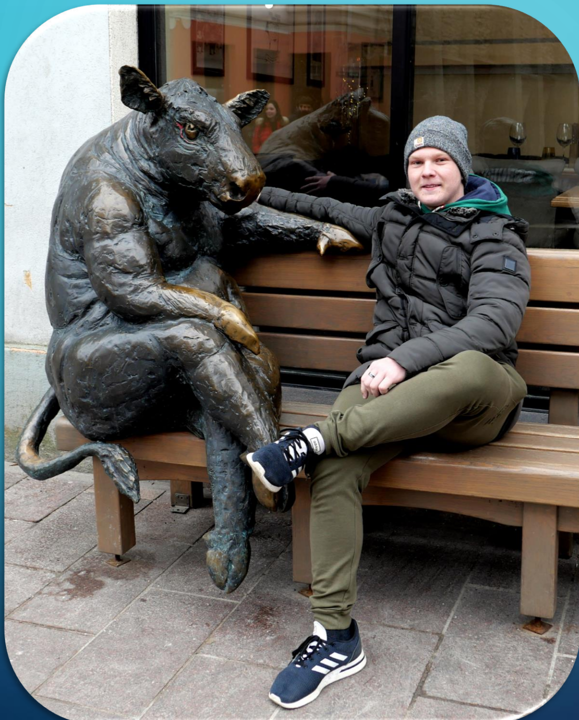
Excursion around the city centre, Tallinn, March 2022