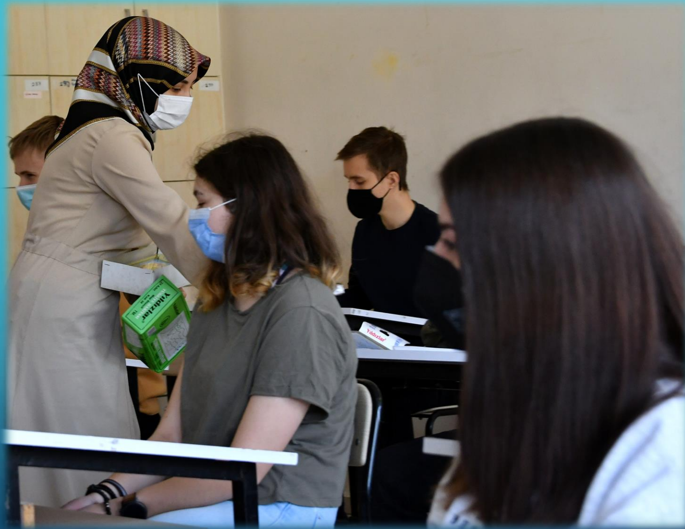
Technical drawing workshop – Dereli, December 2021