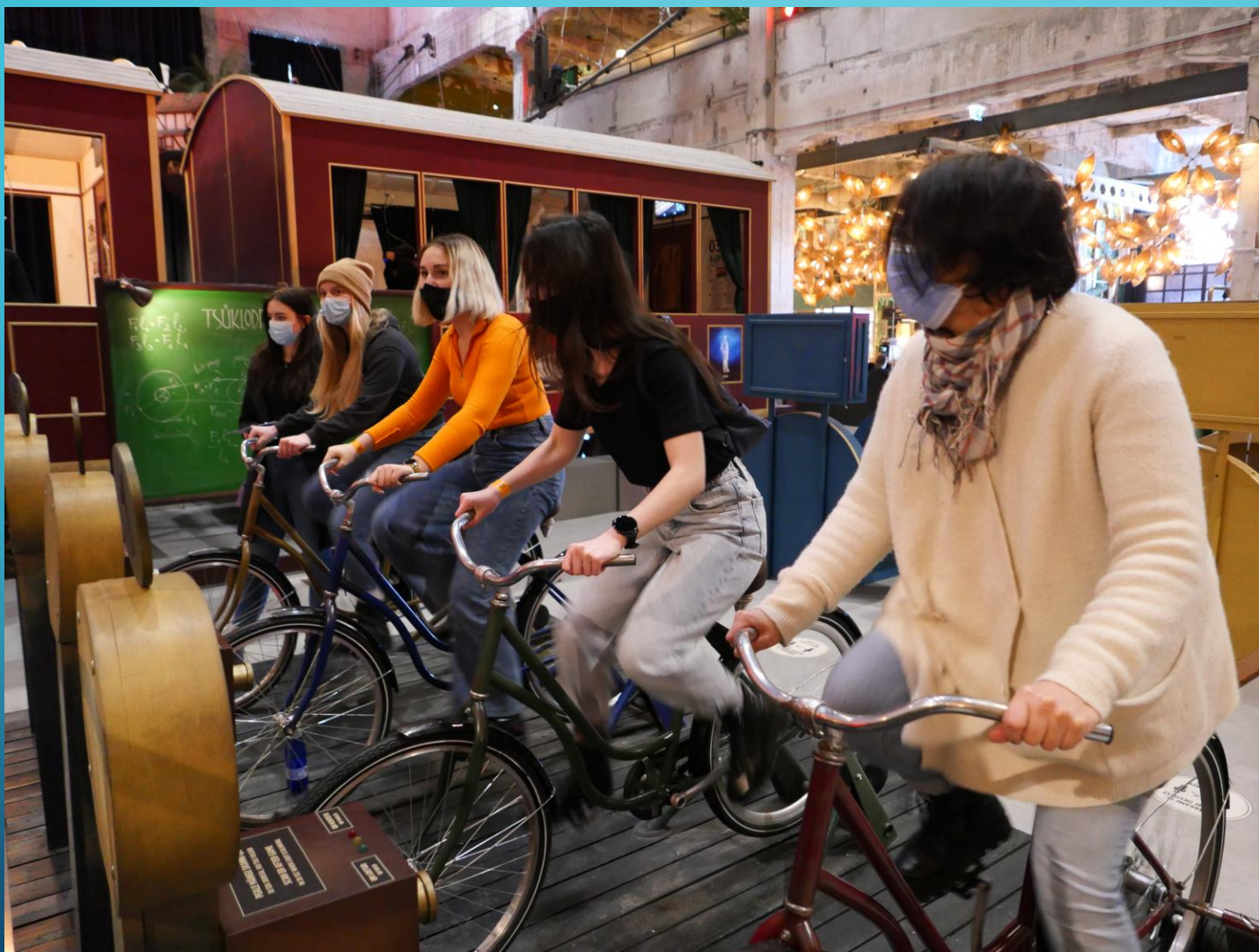
Guided tour at PROTO invention museum, Tallinn, March 2022